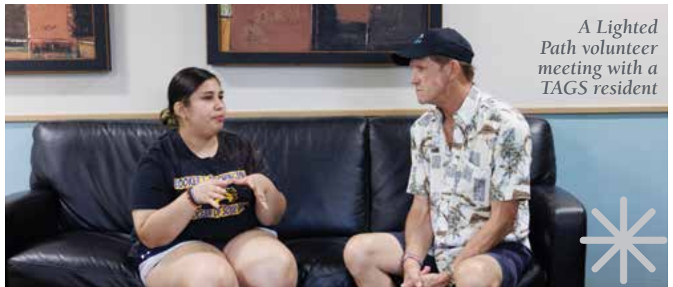
A Lighted Path volunteer meeting with a TAGS resident